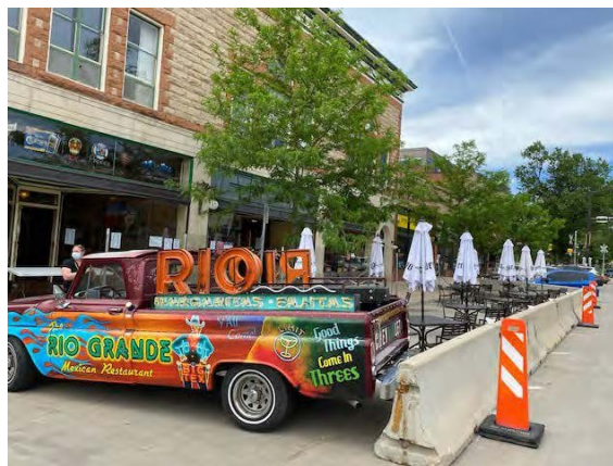
Colorado Arts Relief Program